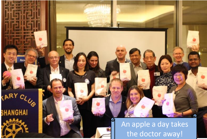
An apple a day takes the doctor away!

22 members, 2 visiting Rotarians, 8 guests, total headcount 30 Happy Money: 2100rmb